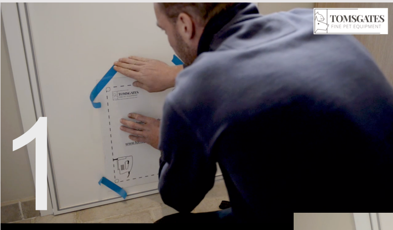
Apply the installation template