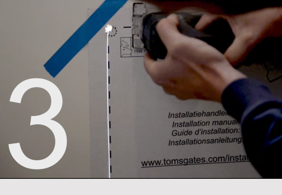
Saw on the line