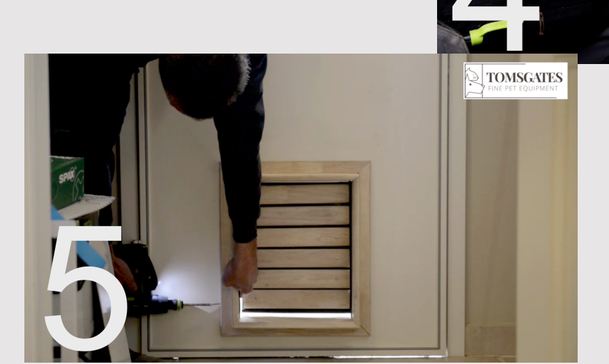
slide up and tighten the inner frame